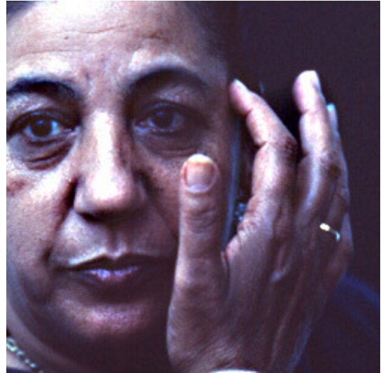
Flamenco singer Juana la del Pipa.