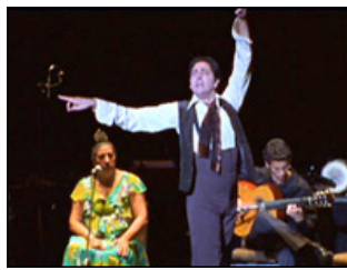
A scene from the movie "Gypsy Caravan"